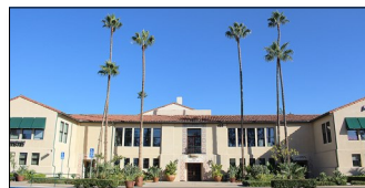
The Old School House